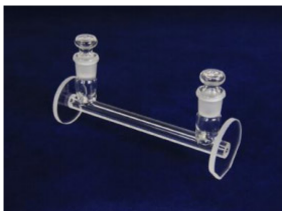
Fig.1 Cylindrical Cell 2.5 mm D x 100 mm L