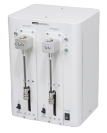
ATS-530 automatic titrator View product information at www.jascoinc.com

J-1500, circular dichroism, near-UV, side chain residues, aromatics, ATS-530, automatic titrator, biochemistry