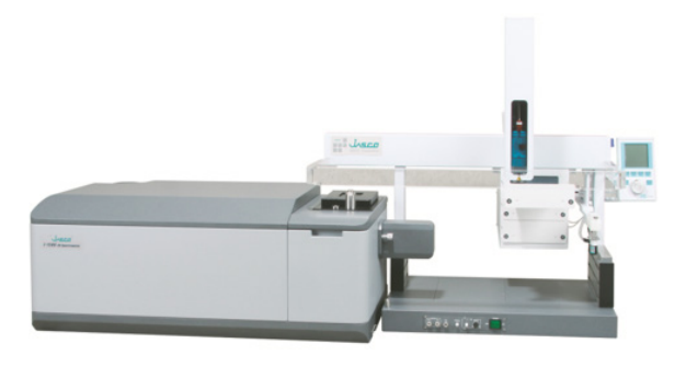
JASCO J-1500-PAL high-throughput system View product information at www.jascoinc.com

J-1500, circular dichroism, J-1700, HPLC, CD-4095, medicinal products, chiral analysis, pharmaceutical